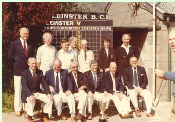
Junior League Winners 1983