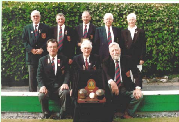
Veterans League Winners 2002