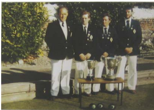
B.I.B.C. Fours Champions 1982