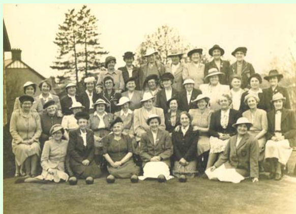
Leinster Lady Bowlers in the early 40's

The Centenary Committee would like to thank all our wonderful members who have made generous cash donations, those who have sponsored various items for use at our functions. Also all of you who have entered our weekly Lotto, which has been the mainstay of our fundraising. Many members have helped in other ways with the garden, painting ,keeping the area round the green tidy, etc .You have all been a part of what Leinster is all about.