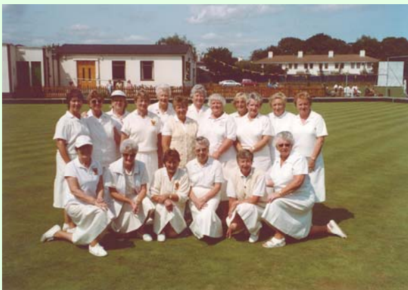
Runners-Up 2004 Open Challenge Cup