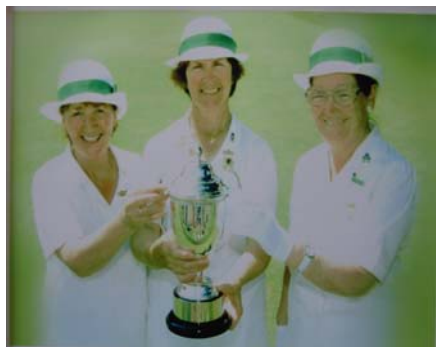
British Isles Triples Champions 2000