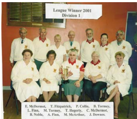
League Winners 2001 Division 1