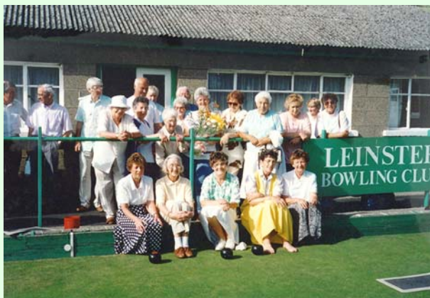
Sunday Rinks 1995