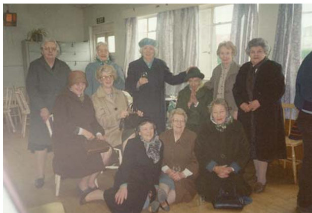
Filming in Leinster "A Man of No Importance" 1994

In 1994, we took part in the film " A Man of no Importance " starring David Kelly, Brenda Fricker and Albert Finney" Dressed in really old-fashioned bowling gear we had great fun on the green and in the church at the confessional scene. In return for our acting skills we were given a cash donation and a new scoreboard.