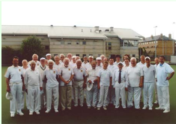
First League Match on the New Surface Saturday 26 th June, 2010 Leinster B.C. v Railway Union Teams