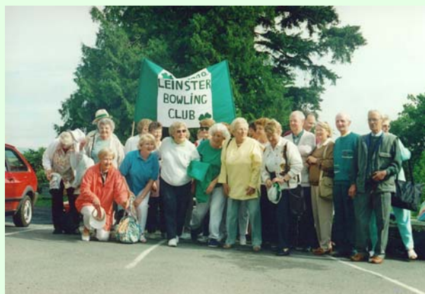
Club Outing To Internationals