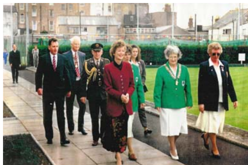
I.W.B.A. Unfurling in Leinster, 4 th April 1997