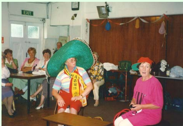
Lady Captain's Fancy Dress